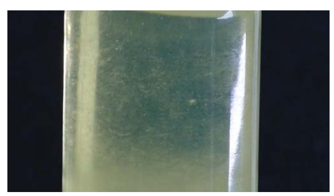
Wax crystals in untreated diesel fuel. The wax crystals will eventually fall out of solution and plug the fuel filter.