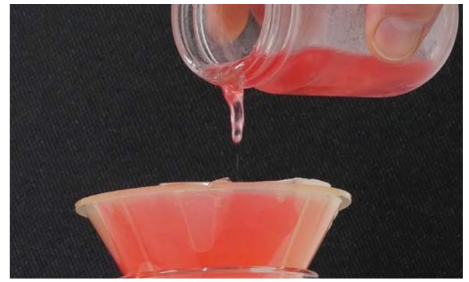
Wax formation in untreated diesel fuel resists pouring.

lowers the cold filter-plugging point (CFPP) by up to 40^{\circ} F (22°C) in ULSD.