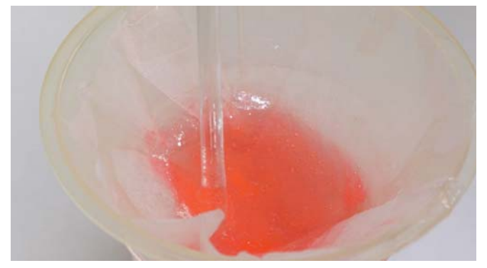
Wax formation in untreated diesel fuel plugs a coffee filter.