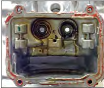
AMSOIL 10W-30 Synthetic Small-Engine Oil 125 hours