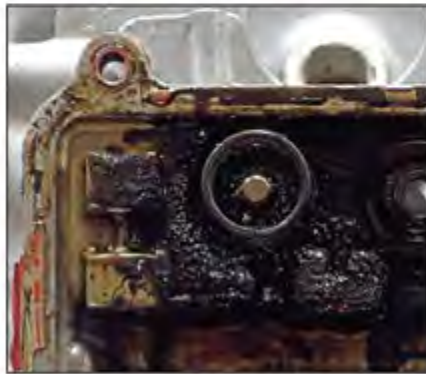
Leading Oil Brand 125 hours